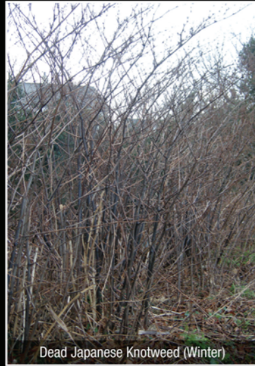
Dead Japanese Knotweed (Winter)