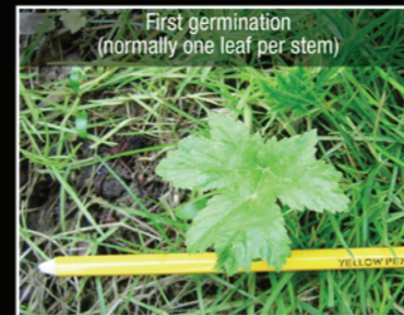
First germination (normally one leaf per stem)