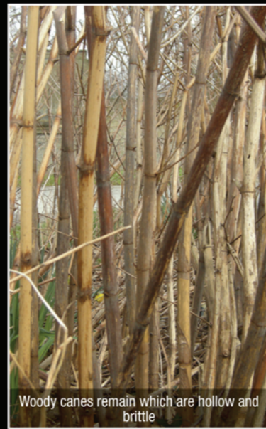
Woody canes remain which are hollow and brittle