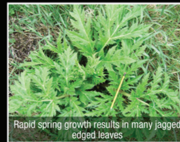
Rapid spring growth results in many jagged edged leaves