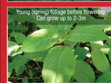
Young (spring) foliage before flowering. Can grow up to 2-3m