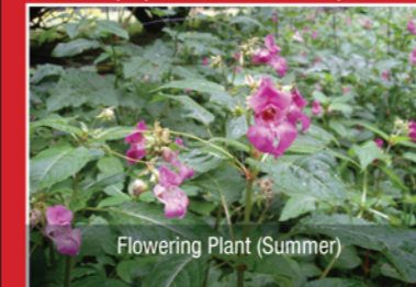
Flowering Plant (Summer)