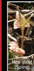
New shoot (Spring)