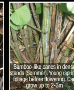
Bamboo-like canes in dense stands (Summer). Young (spring) foliage before flowering. Can grow up to 2-3m