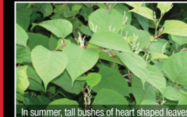
In summer, tall bushes of heart shaped leaves