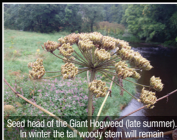
Seed head of the Giant Hogweed (late summer). In winter the tall woody stem will remain