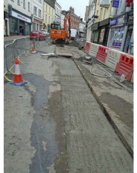
Ready Mix Concrete Sub Base Installation