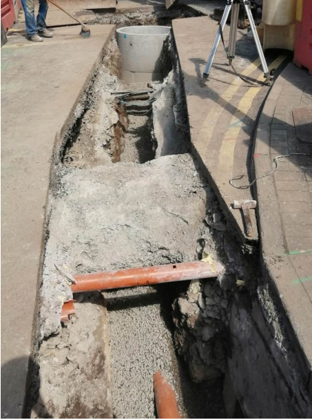
Drainage Installation Darling Street