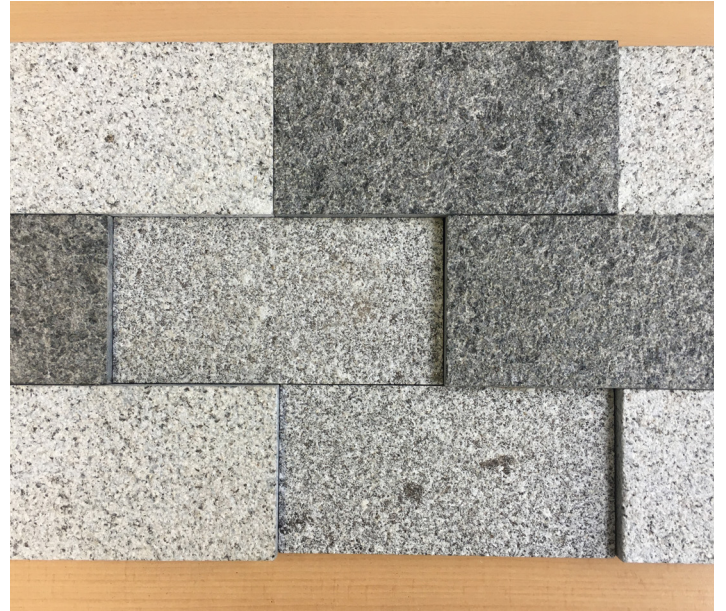
Example Of The Paving Colour Palette