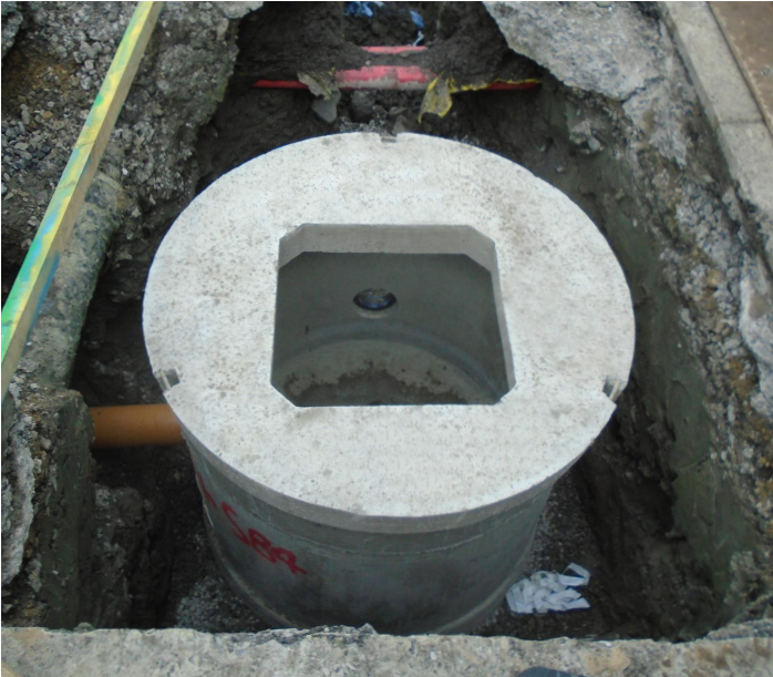
FP McCann Precast Manhole Installation