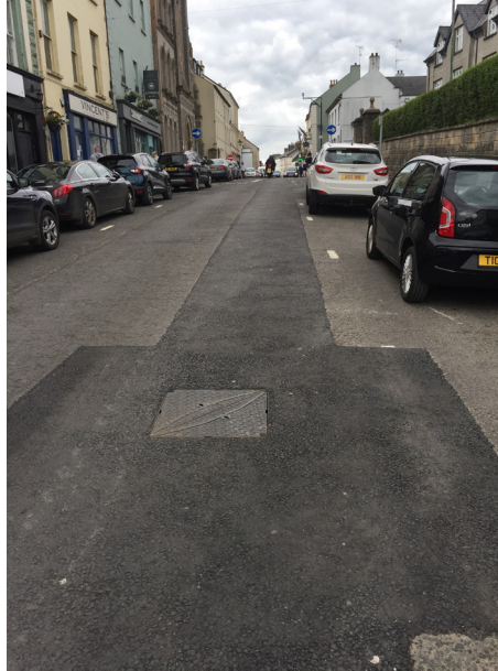
Temporary Road Surface Installed