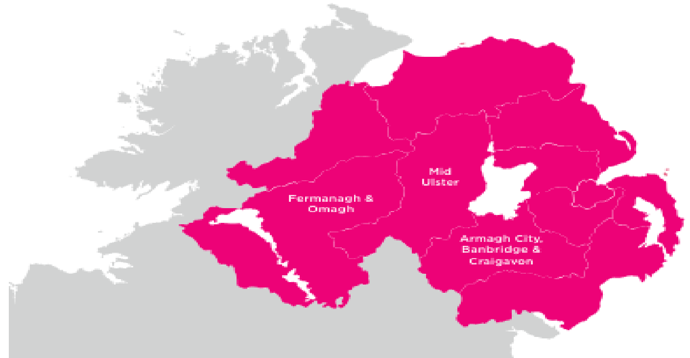
Fig. 1. MSW Council areas

TURBO-CHARGED BY MID SOUTH WEST GROWTH DEAL