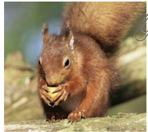
RED SQUIRREL FEEDING

Please ensure you follow the directions on the labels of the disinfectant and mineral supplements.